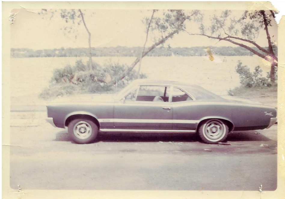
My hot little '66 Pontiac looking good on the shores of Lake Harriet about a block from home

invaluable, firsthand experience with dealing with the public, stock work, and operating old-fashioned, mechanical cash registers. We always made time for playing sports, had a variety of jobs outside the stores, drove fast cars, and usually had a bunch of girlfriends along the way.